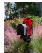
New... Winslet Ribbon Bow