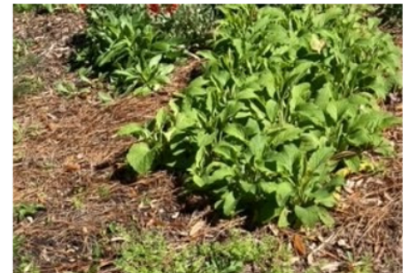
Nigella ("Love In A Mist")

Another plant that is my pride and joy is Clivea - I'm lucky mine is doing so well. It is native to South Africa, so it blooms in our Winter season – and is still blooming now. Leaves are fat so the DDEI (deer don't eat it). I cover it up with frost blankets if it gets lower than 40 degrees at night, but it is well worth it. You don't see them for sale much around here, so if you do find one, snag it!! They even grow in some shade!!