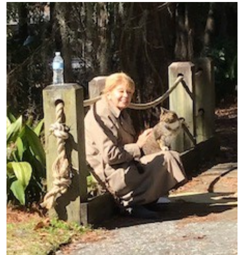
Visitor Feeding the Stray Cats