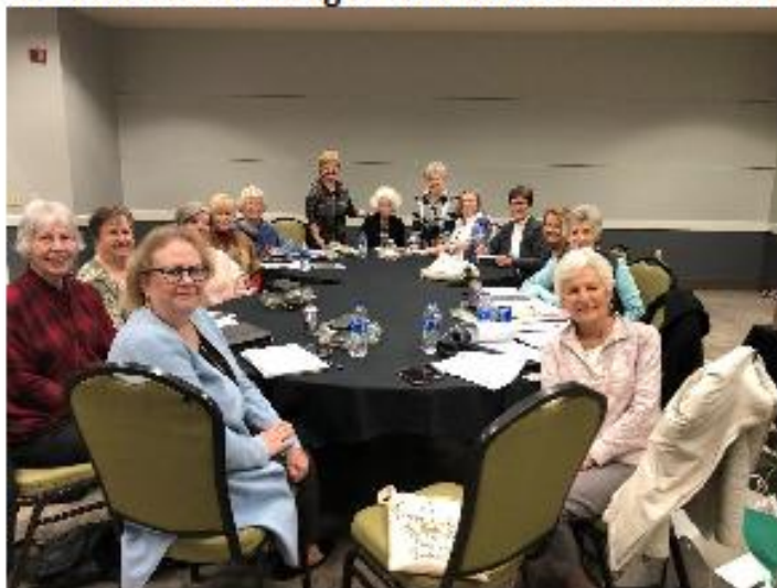
Pictured are Oleander Convention Committee members meeting in Macon.

We hope that you will plan now to be a part of "Gardening in Macon" on April 12-13, 2022. Do not miss this exciting time in Macon. Join us and register today.