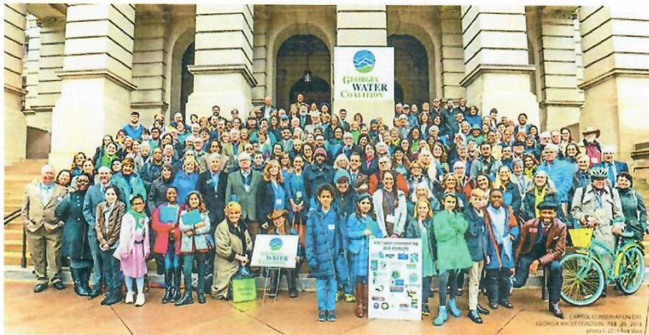
Capitol Conservation Day photo from February, 2019